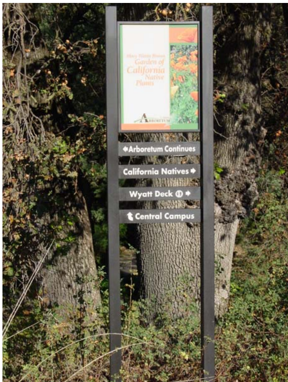
Wayfinding sign installed