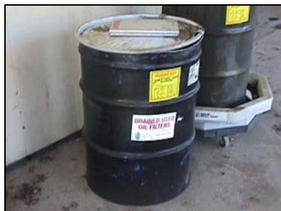
Used Oil Filter Drum