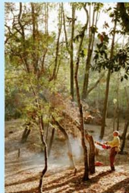
Infected hazard trees often need removal, especially in public spaces

GOAL: Evaluate disposal options, potential uses, technical feasibility, and market potential