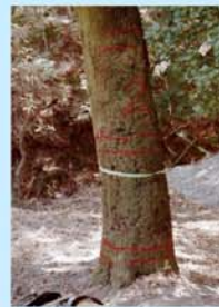
Tree and wood quality data are collected from uninfected and infected host trees

SODBusters hopes to provide recommendations on the safe removal, transport, and utilization of SOD-infected plant materials. This can affect everything from how green waste from private homes is sent for processing, to providing raw material for the forest product industry.