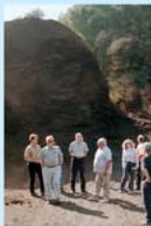
Composting and combustion at biomass power plants are viable options if the risk of disease spread is manageable