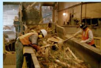
Current methods of collecting and sorting green waste are not sufficient to address SOD-infected material

GOAL: Determine effect of SOD on wood quality