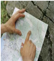
Having trouble finding your way around UC/ ANR policies and procedures?

Understanding the University's policies and procedures can be tough, and it's easy to get lost try-